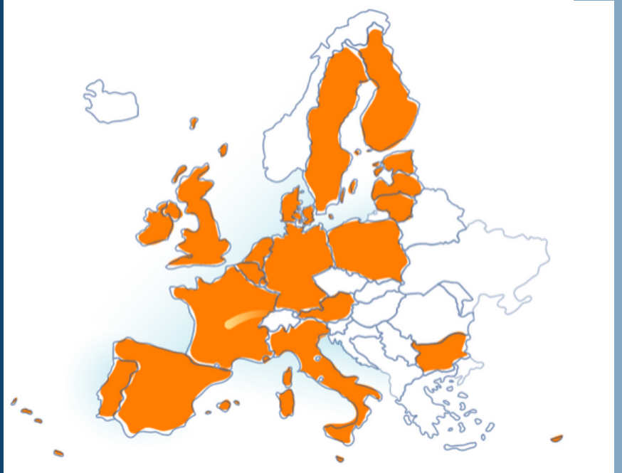
ESTIMATED SHARE OF SCT INST VOLUMES IN TOTAL CT* VOLUMES